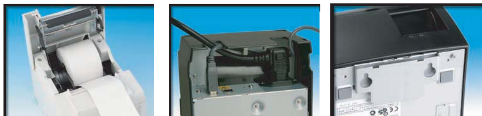
■ paper guide for 58mm paper roll ■ Tight design for cable connection ■ easy Installable Wall Mount bracket